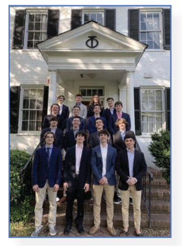
The spring 2021 pledge class at their in-person initiation ceremony